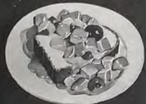
Need a warm-day dessert? Serve Del Monte Fruit Cocktail, frozen.