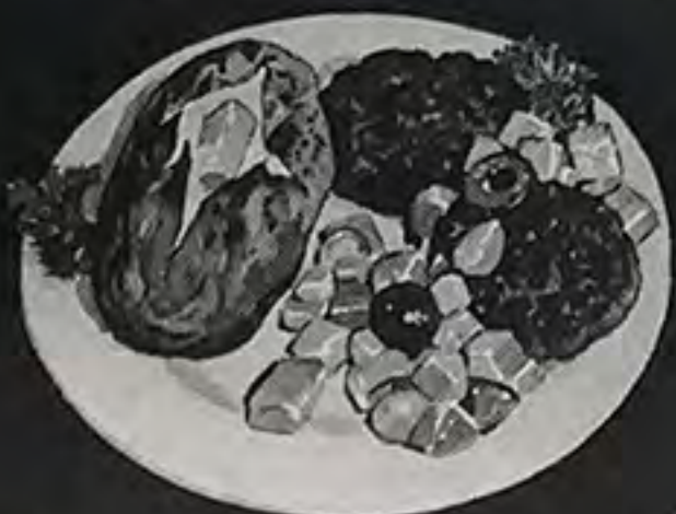
Even hamburger is "news"—served with warmed Fruit Cocktail.